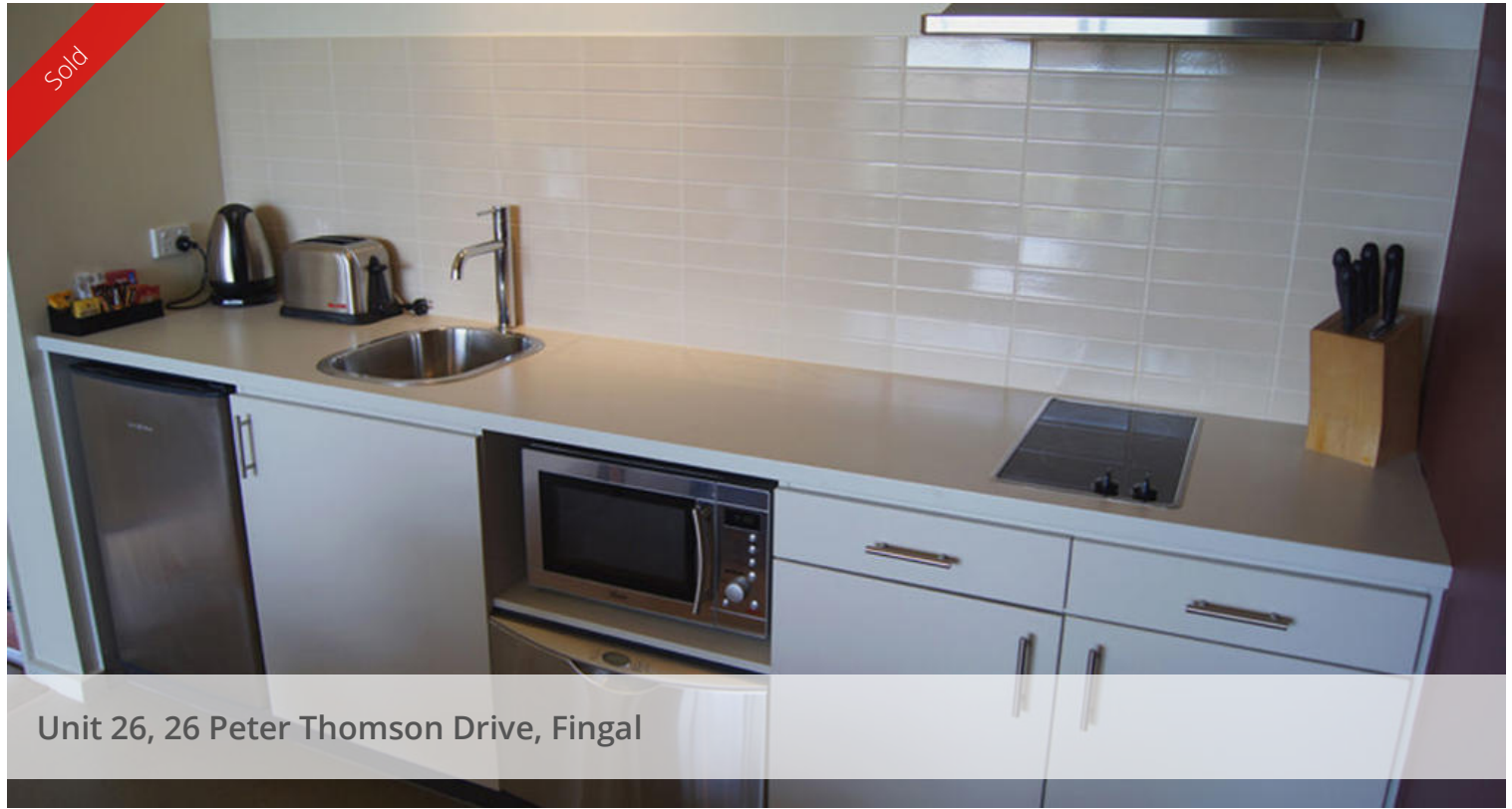
Unit 26, 26 Peter Thomson Drive, Fingal