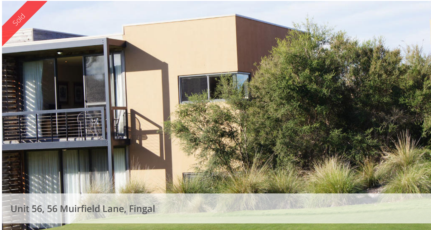
Unit 56, 56 Muirfield Lane, Fingal