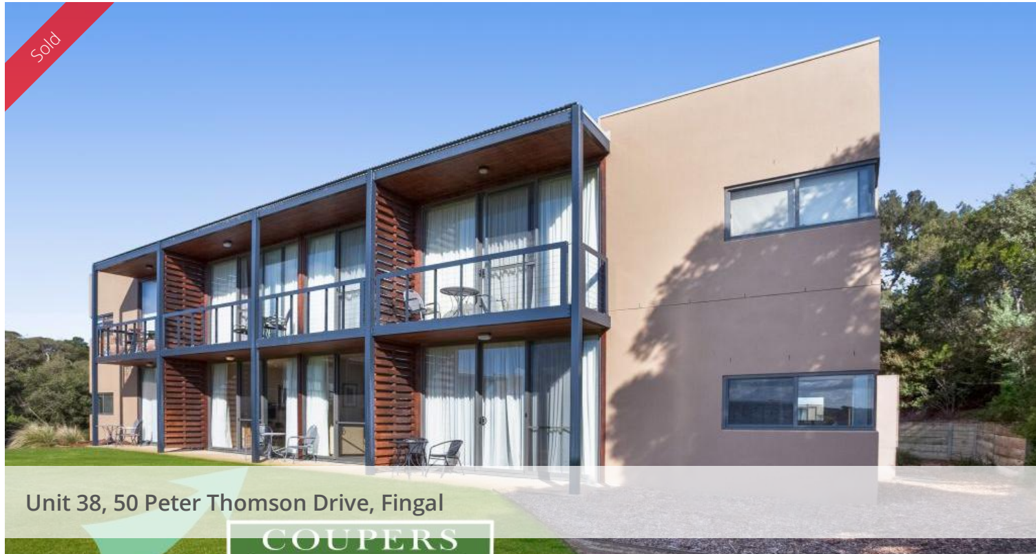
Unit 38, 50 Peter Thomson Drive, Fingal