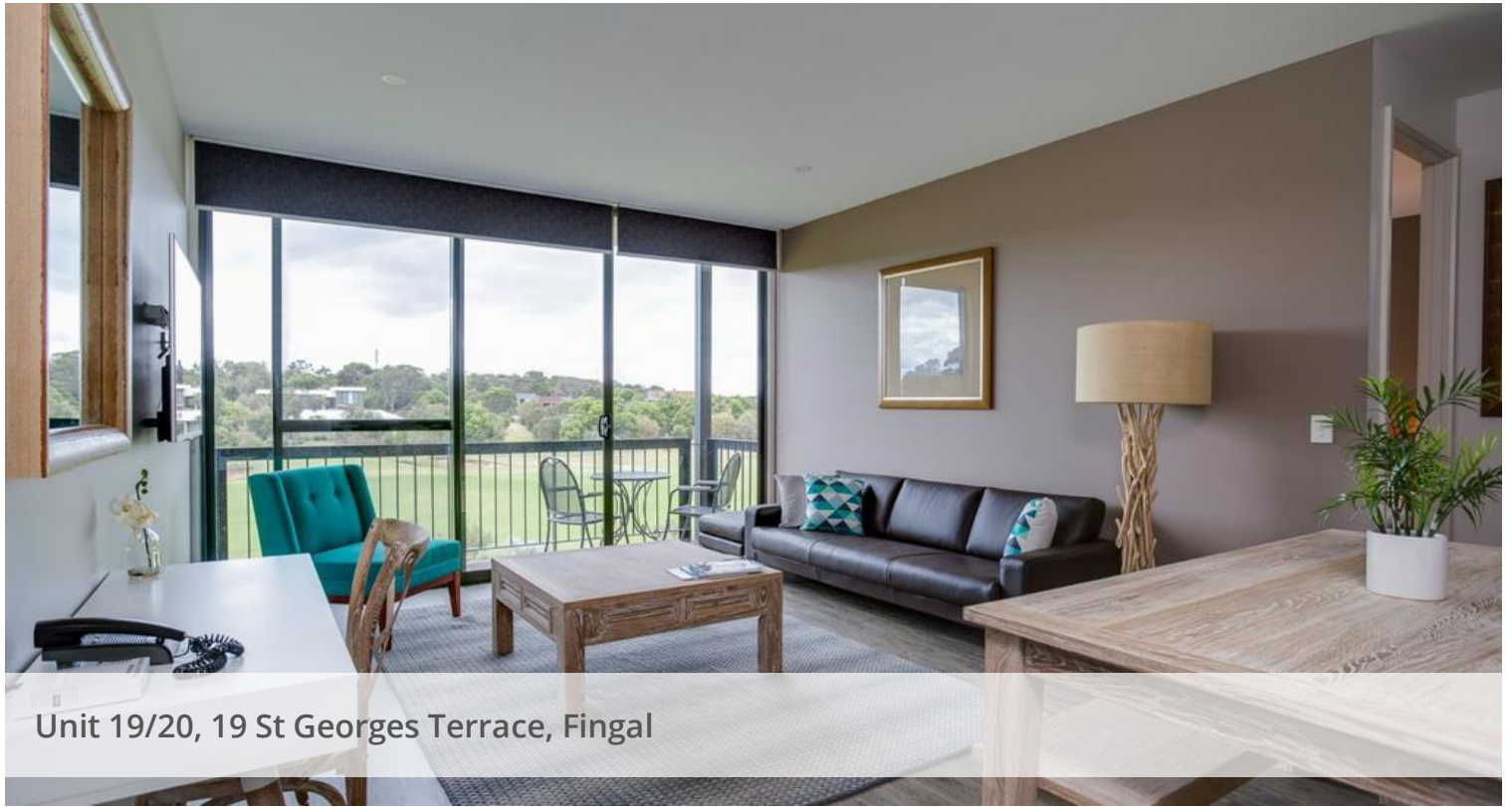
Unit 19/20, 19 St Georges Terrace, Fingal