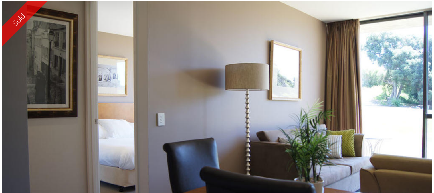
Unit, 44/55 Peter Thomson Drive, Fingal