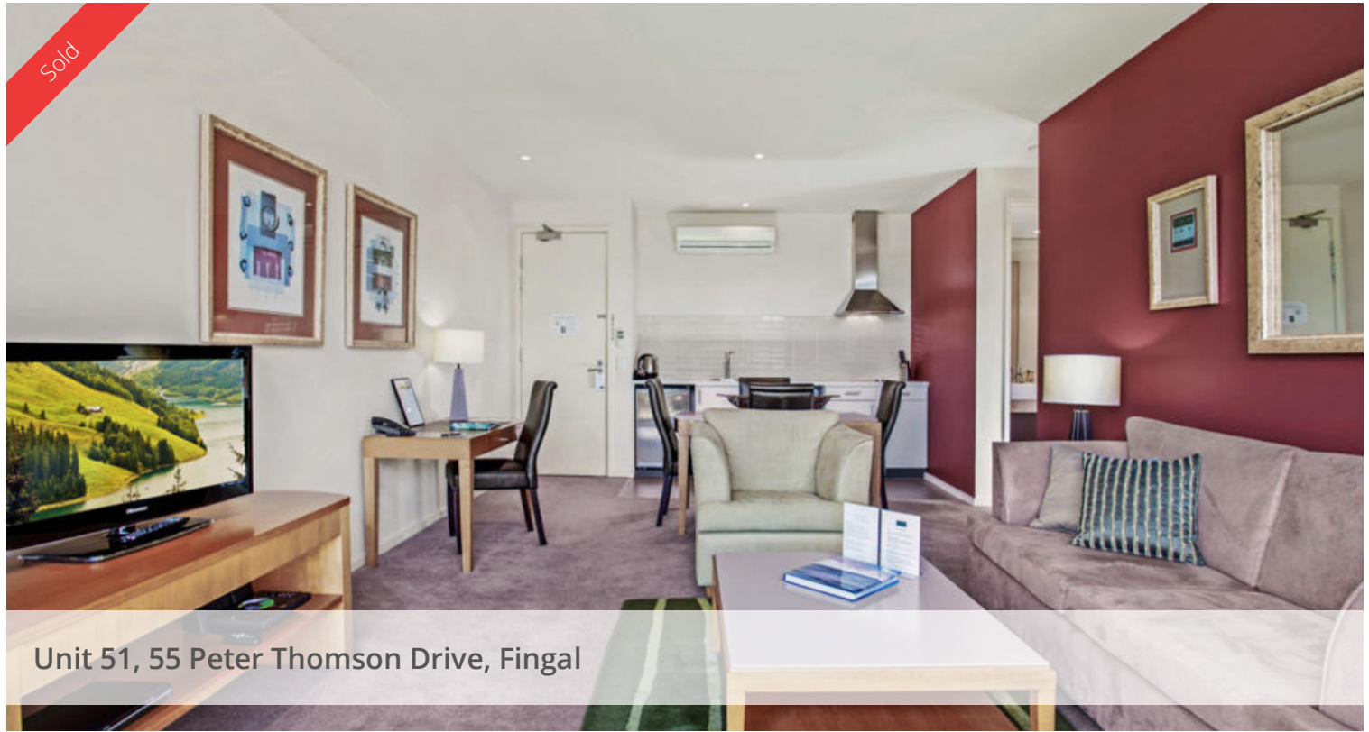
Unit 51, 55 Peter Thomson Drive, Fingal